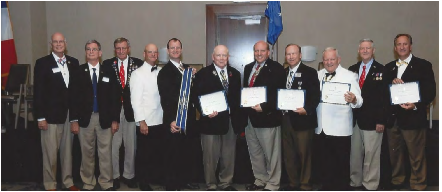
At the 128th National Congress in Houston, TX, the Virginia Society was named the Best State Society in the United States of those with 1000+ members. The Virginia Society won both the national Americanism Award and the President General's Activities Award, the first time it has ever won both awards.